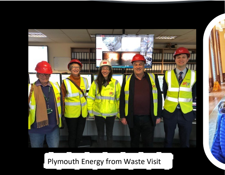
Plymouth Energy from Waste Visit

Responded to public concern over 5G and established a spotlight review, already hearing from 1300 survey responses and 150 people in person.