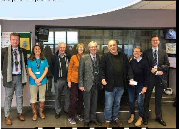
Exeter Energy from Waste Visit