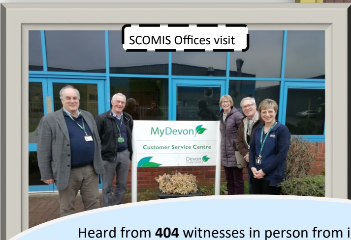
SCOMIS Offices visit

Visited community hospitals, care homes, social work offices, schools, NHS facilities and charities speaking to more staff and service users than any previous year.