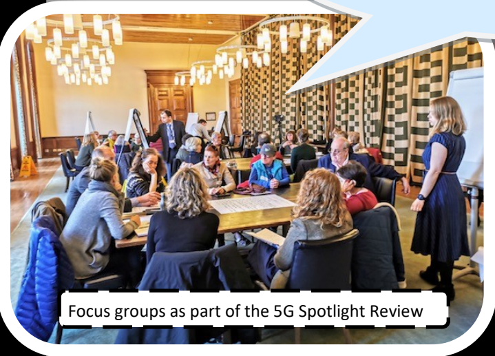
Focus groups as part of the 5G Spotlight Review