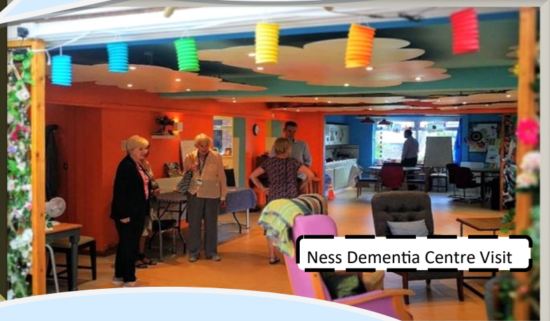
Ness Dementia Centre Visit

Heard from 404 witnesses in person from industry, the NHS, charities, employees, universities and members of the public in Task Group/Spotlight Reviews.